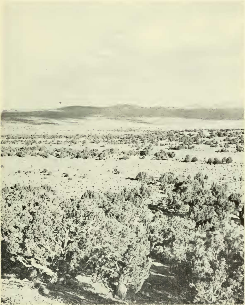
Fig. 1. Study area, a typical sagebrush-juniper community.